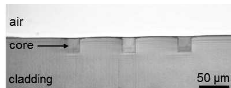
Fig. 2 Cross section of fabricated planar optical waveguide using PMMA and OG198-54.