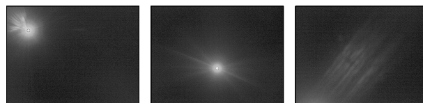
Fig. 2 Various stray light artefacts; left: fan, middle: beam, right: side light

of test results, to enhance the test coverage and at the same time to reduce test duration, an objective and automated stray light analysis was developed. While moving the camera by means of a motor unit in dark surroundings, images are acquired which show an external light source mapped as bright spot on dark background at different positions. In the following, a machine learning algorithm will be presented which provides reliable results in detecting stray light artefacts.