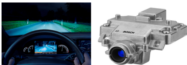
Fig. 1 Night Vision system of Bosch (left) and HDR camera (right)

Video based driver assistance systems are gaining increased importance in the domain of night vision improvement or object and lane measurements. The active infrared night vision system of Bosch (see Fig. 1 left) provides a three times more extended visibility at night compared to conventional low-beam headlights without blinding oncoming traffic. The road scene illuminated by infrared light is recorded by a high-dynamic-range CMOS (HDR) camera (Fig. 1 right) and presented as a black-and-white image on a display. The HDR camera is able to acquire the outperforming wide luminance range of night sceneries using a nonlinear conversion (for a more detailed description see [1]).